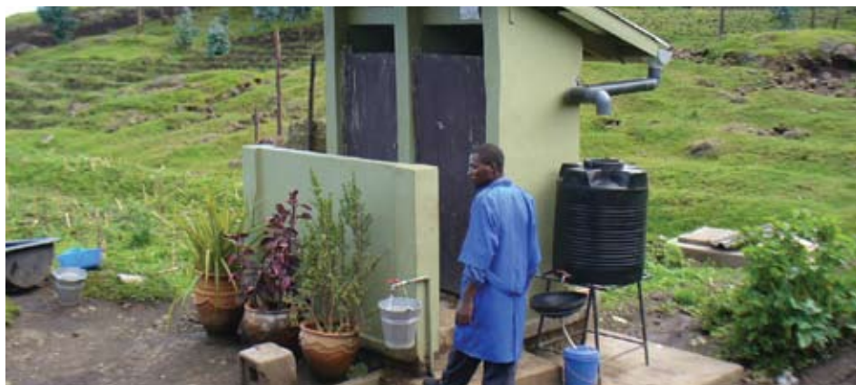
Latrines outfitted with a rain-catchment system in rural Rwanda.