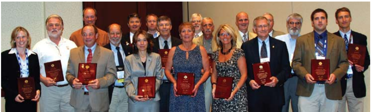
The 2007–2008 Kenneth J. Miller Founders' Award recipients.