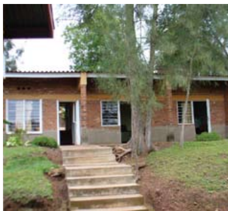
Water For People's offices in Kigali, Rwanda.