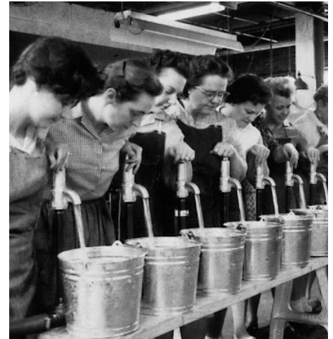
Ford Meter Box employees test Fordilla valves in the early 1960s.