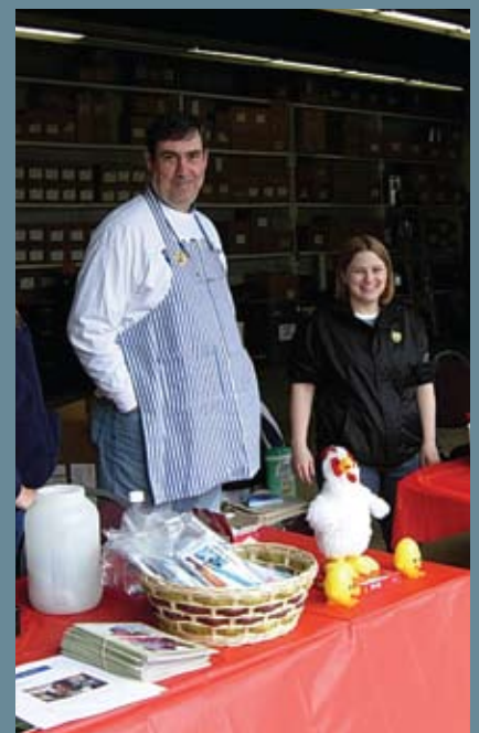
“Chicken Flickers” from Valparaiso City Utilities.

At $5 for a half-chicken, they sold 500 tickets and raised more than $1,100, surpassing their $1,000 goal. The whole team came together to help out with signs, ticket sales, boxing, serving, and putting together goodie bags to spread the word about Water For People’s important work. Everyone played a part in the fundraiser’s success and had a fun time in the process.